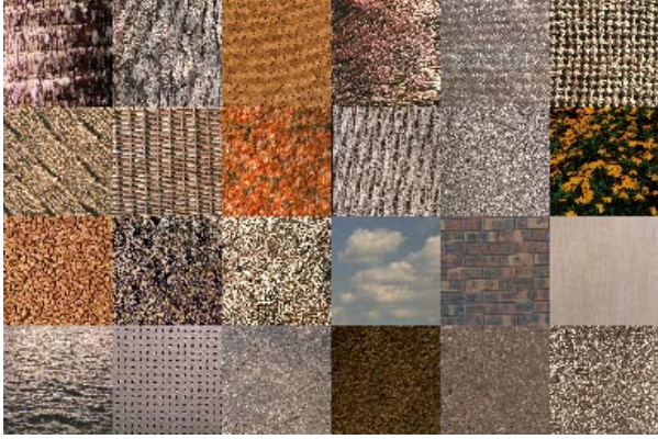
Fig. 1. Textures from the Vistex Database: Bark0; Bark12; Fabric0; Fabric4; Fabric7; Fabric8; Fabric11; Fabric13; Fabric15; Fabric17; Fabric19; flowers0; Food.0000; Leaves12; Grass1; Clouds0; Brick0; Wood2; water0; Tile7; Stone4; Sand.0000; Misc2; Metal0.

of the classification decision taken as: