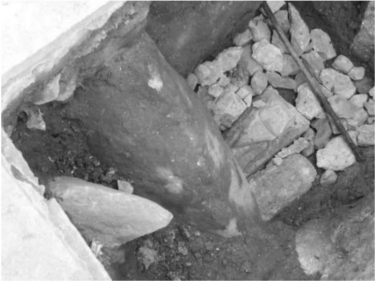
Figure 6: Unrecorded cut adjacent to a temple platform in Hanuman Dhoka Durbar Square for the installation of a lamppost.