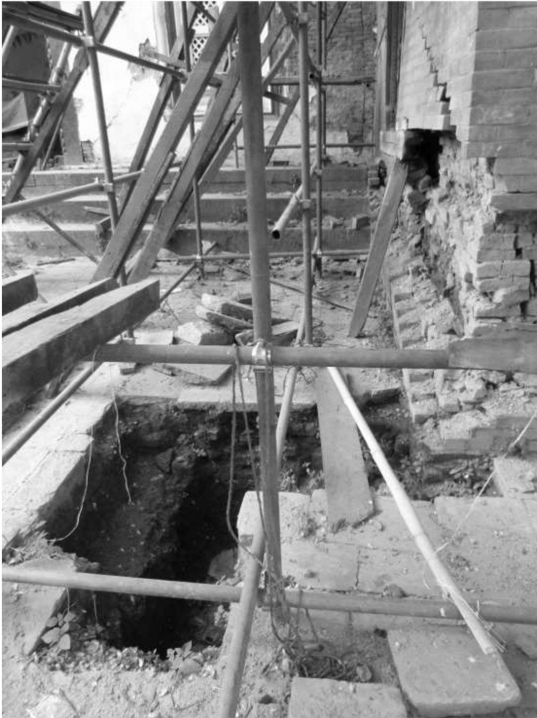
Figure 5: Unrecorded excavation trench cut alongside north facing wall of the Degutale Temple in Hanuman Dhoka Durbar Square. Photographed in October 2015.