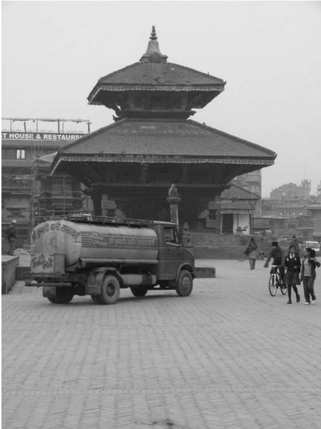
Figure 7: Heavy vehicle passing through the main Durbar Square at Bhaktapur. Photographed in October 2015.