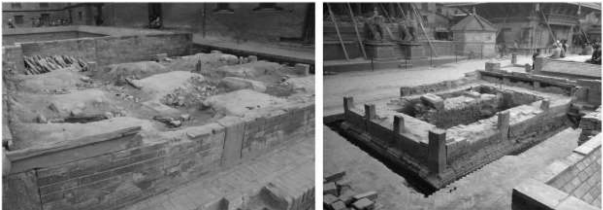
Figure 4: The collapsed Mani Mandapa in Patan, photographed in October 2015 (left) and May 2016 (right) illustrating unrecorded excavation of the foundations.