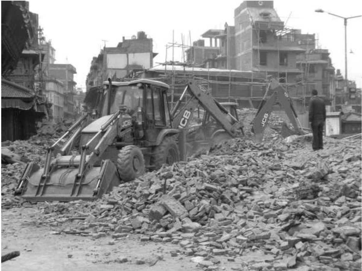
Figure 2: JCBs clearing the debris at Kathmandu on the 26 th April 2015 (Image courtesy of Kai Weise).