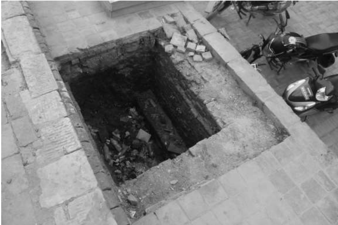
Figure 3: One of the unrecorded trenches opened on behalf of KVPT located on the lower plinth on the west of the Char Narayan Temple. Photographed in October 2015.