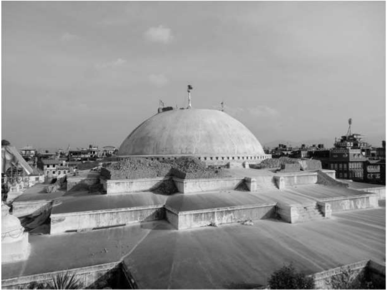
Figure 8: Image of the Baudhnath Mahacaitya after the unrecorded removal of the brick tower. Photographed in November 2015