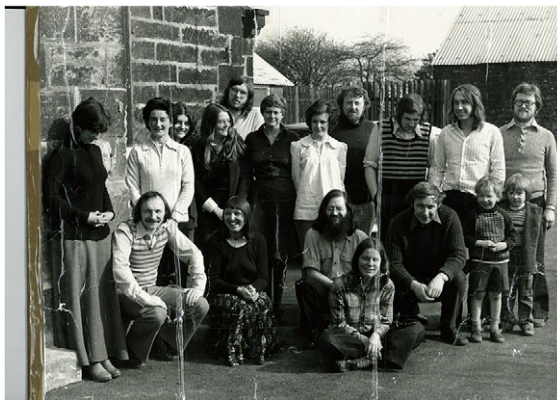
Figure 2 The CDP team c. 1975