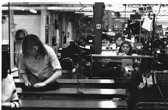
Figure 4 Women at work in the Levi Strauss clothing factory, 1976

The late 1960s to mid-1970s was the 'organizing stage' of the women's movement (Ryan, 1992) and some women CDP workers were actively involved in mobilizing women to create commitment (Gamson, 1975). This fitted with the CDP's politicizing objective, which was initially pursued through industry and employment work with the Trades Council, particularly the Working Women's Charter, drawn up by trade unionists and activists in the Women's Liberation Front and launched in 1974 (Saner, 2014). The Charter aimed to 'raise demands affecting women both as housewives and paid workers' (North Tyneside CDP, 1978b, p. 164). There were ten demands including equal pay, equal employment opportunities, maternity