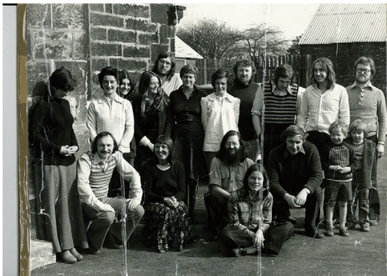
Figure 2 The CDP team c. 1975