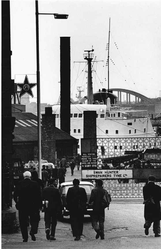
Figure 3 The early morning shift makes its way to work at Swan Hunter's ship repair yard in North Shields, 1976

investigated in detail the historical development of industry and employment (Figure 3), the process of deindustrialization, associated loss of traditional industries and effects of long-term unemployment. They also identified where power lay and how decisions affected local workers. The aim was: