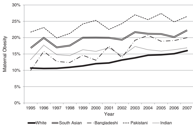
Figure 2 A Comparison of First Trimester Maternal Obesity Incidence over Thirteen Years in England stratified for South Asian and White Ethnic Groups. Legend: Maternal obesity is classified as a BMI >27.5kg/m 2 for South Asian women, and ≥30kg/m 2 for White women.

This is the first national maternal obesity dataset to be analysed within the UK or internationally using the WHO Asian-specific BMI criteria. Applying these criteria doubled the incidence of first trimester obesity among South Asian women compared with using the general population criteria for obesity. The data also identified that, following adjustments for potential confounding, the incidence of first trimester obesity is higher among South Asian and Black women compared with White women. Moreover, Pakistani women have the highest odds of being obese compared with any other ethnic group when using the Asian-specific BMI criteria. These findings are representative of obesity