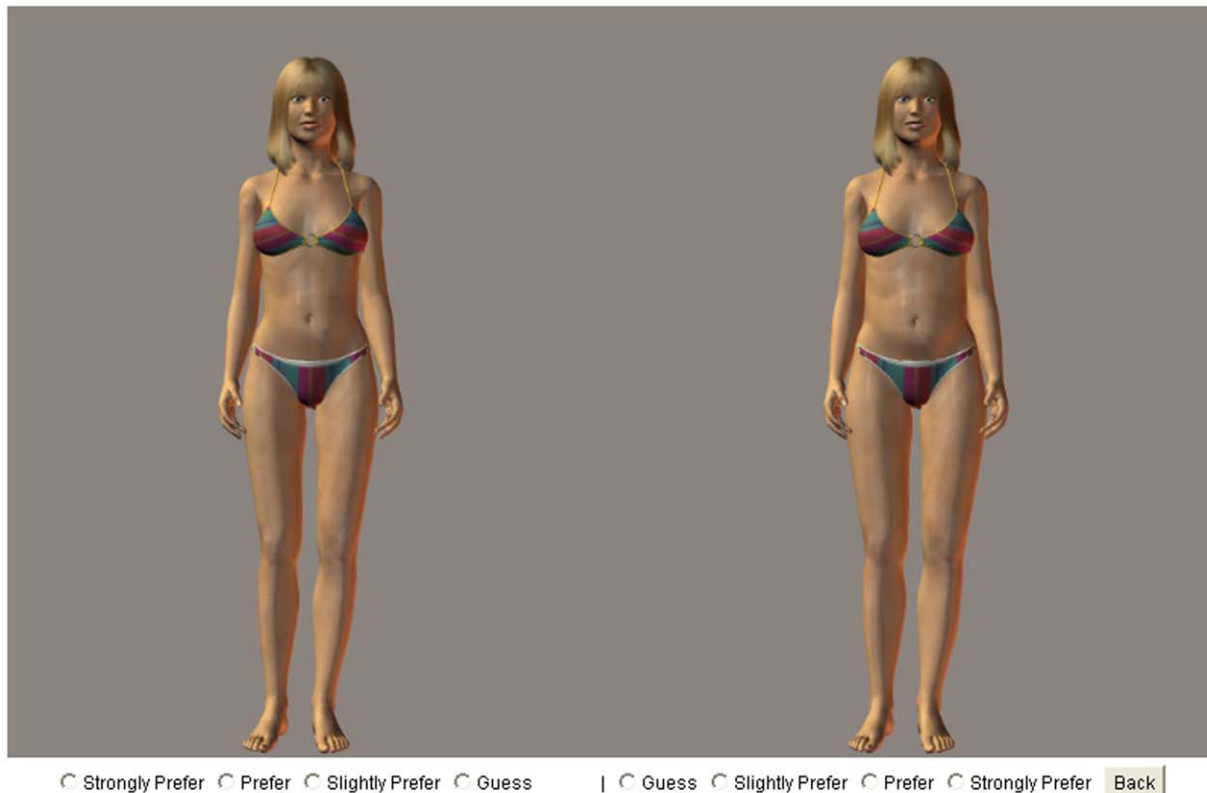
Figure 1. Example frame from the body size preference task. doi:10.1371/journal.pone.0048691.g001

Please indicate which body you prefer and how much you prefer it, by clicking on the line below.