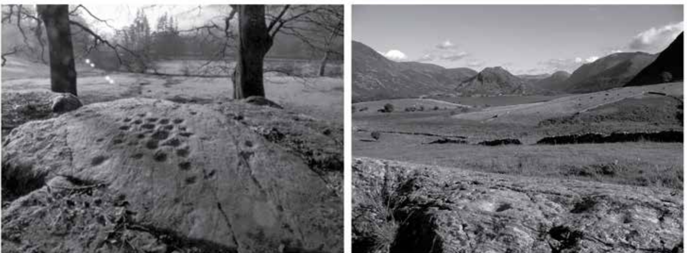
Fig. 1. Typical glacially-smoothed outcrops with cup-mark scatters. Right: Rydal; left: Barber's Rock, Loweswater with view over Crummock Water towards Central Fells and stone quarries.

Although widely dispersed across a large area (c. 30 km x 20 km) and in valleys divided by mountainous terrain, the panels reflect similar choices made by the people who created them; these low-lying outcrops with their simple scatters of cupules are distinct from rock art in neighbouring regions. Immediately to the east, along the valley of the river Eden, a different form of rock art dominates. Here, more complex multi-ringed motifs, spirals and chevrons are found on boulders in monumental (including burial) contexts, with a high proportion of fragments and portable pieces. These examples are likely to be related to ritual activities focused on the confluence of the rivers Eden and Eamont, and represent a complex palimpsest with some carved stones potentially re-deployed several times, and others having later monuments