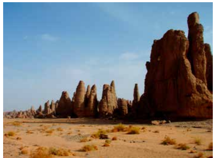
Fig. 1. A stone city on the Tassili Plateau.

Before 10,000 BP the Central Sahara experienced different regional climates. While high altitude regions had significant rainfall causing the creation of lakes, they were surrounded by extremely dry lowlands (Maley, 2004). The onset of a wet climate in the lowlands in the 10th millennium BP, which corresponded with the beginning of the Epipalaeolithic phase, represented an important change in the Central Saharan environment. Thanks to the possibility of