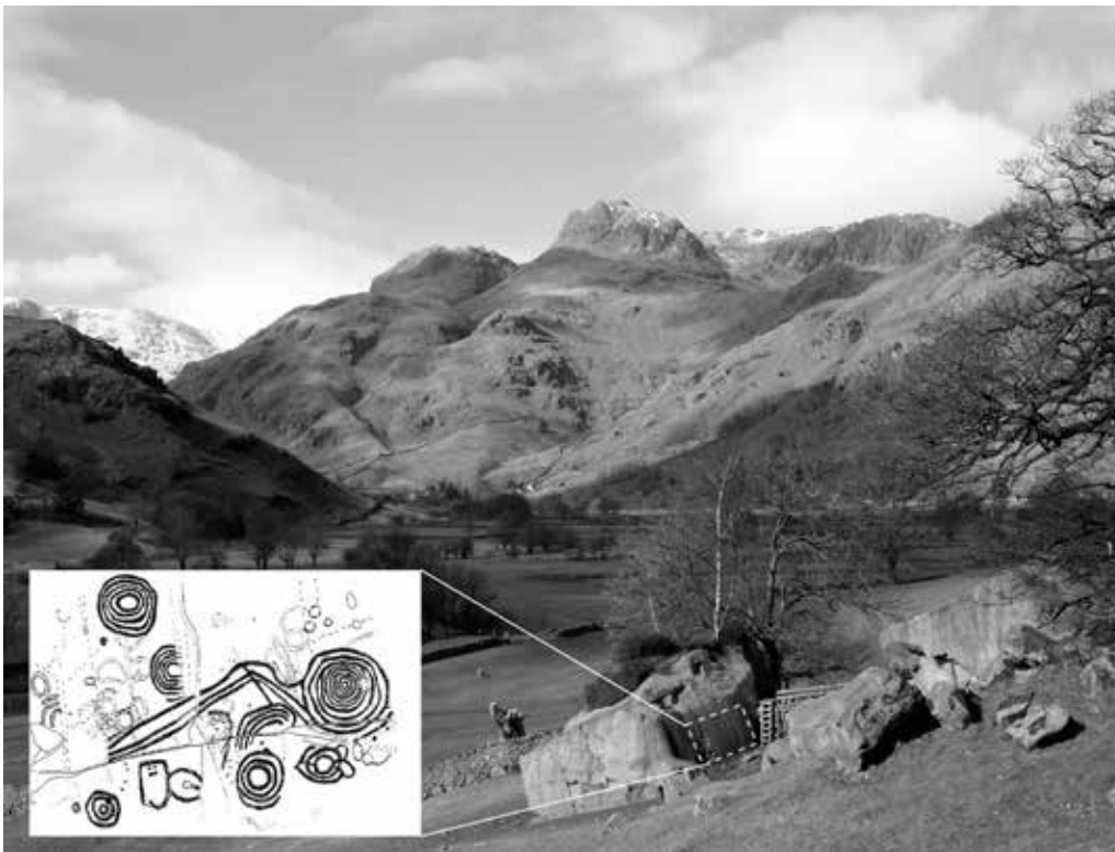
Fig. 4. Complex motifs on panel at Copt Howe (insert after Beckensall, 2002) with the Langdale Pikes behind (site of stone quarries).

less dense immediately along the shores of the lakes, some of which have a gravel beach, providing an easier and more direct route along the valley. This would have been particularly important if a successful season of quarrying resulted in a heavy pack of roughed-out axe-heads.