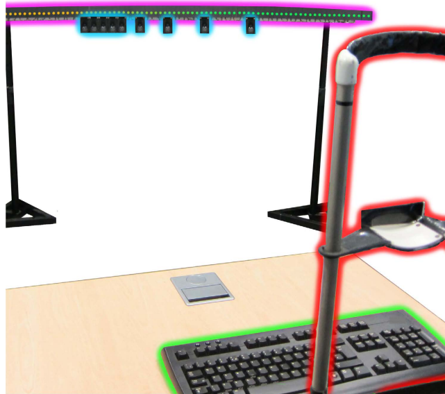
Figure 3. The Ring of LEDs and Speakers. During the experiment, the speakers (outlined in blue) were hidden using an acoustically transparent curtain to ensure that participants were unaware of their locations. Participants maintained their head position fixed at straight ahead, using a chin rest (outlined in red), and entered responses using a dial (not visible) and keyboard (outlined in green).

location estimates. However, inconsistent with reliance on prior knowledge, we found that biases towards the periphery also increased with eccentricity, despite no corresponding increase in uncertainty. We also saw significant effects of training: Both biases and variability declined in during- and after- training phases compared to before- training.