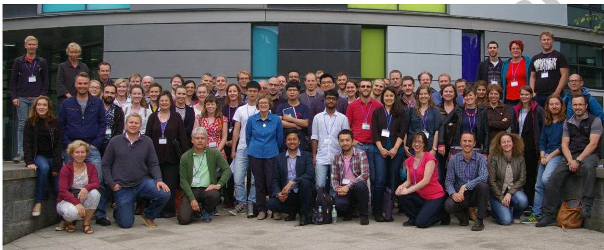
Figure 1: Delegates of the 4 th International Workshop on Highly Siderophile Element Geochemistry