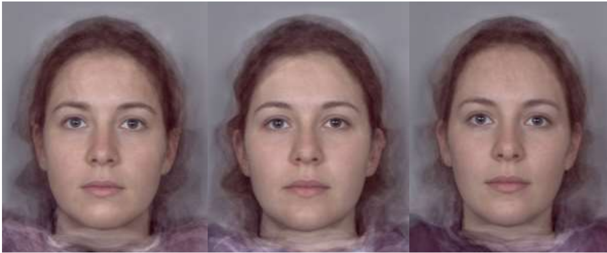
Figure 1. Batch 1 female composites (neutral expression). From left to right: separated parents, poor parental relationship, good parental relationship.