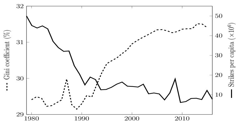
Figure 2: Trends in the Gini coefficient and number of strikes per capita for the countries that are not Latin American within our sample. The observations are averaged across all relevant countries for each year.