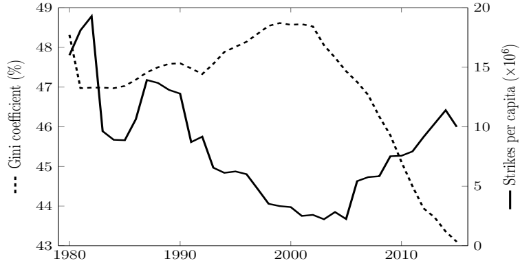
Figure 3: Trends in the Gini coefficient and number of strikes per capita for Latin American countries within our sample. The observations are averaged across all relevant countries for each year.