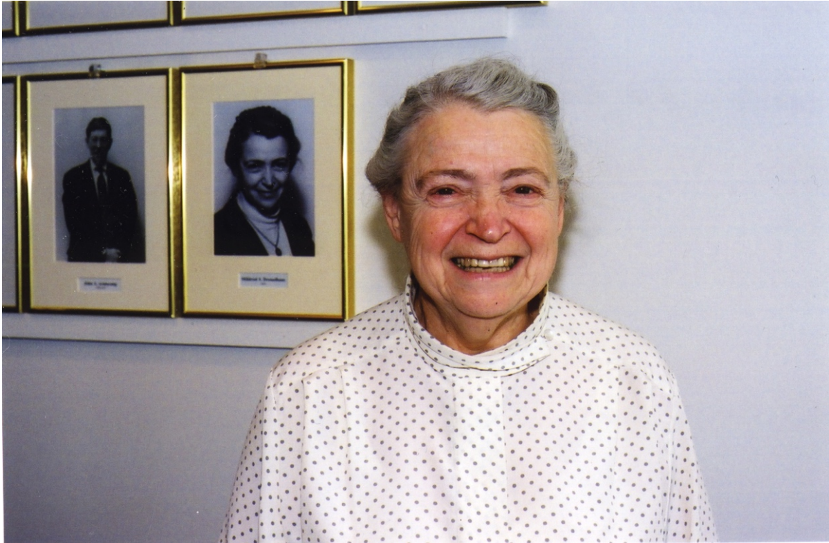
Figure 1. Mildred Dresselhaus stands by her portrait at American Institute of Physics.

and much-lauded teacher. The second reveals some of the strategies committed teachers could employ to combat the dog-eat-dog environment that began to prevail as the population of physics students boomed in the post-World War II years. Together, they help us think about why we teach physics the way we do.