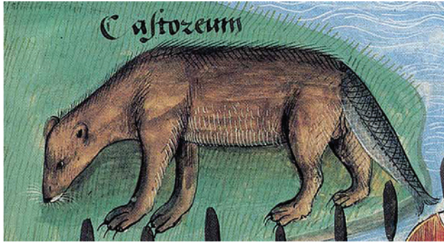
Figure 5: Representation of a Eurasian beaver, Castor fiber , from the Liber de simplici medicina (Livre des simples médecines, ca. 1480 – Paris, Bibliothèque Nationale, Département des manuscrits, Français 12322, f. 188) by Matheus Platearius (Salerno, 12th century). Available from Wikipedia commons, https://fr.wikipedia.org/wiki [08 August 2018] .