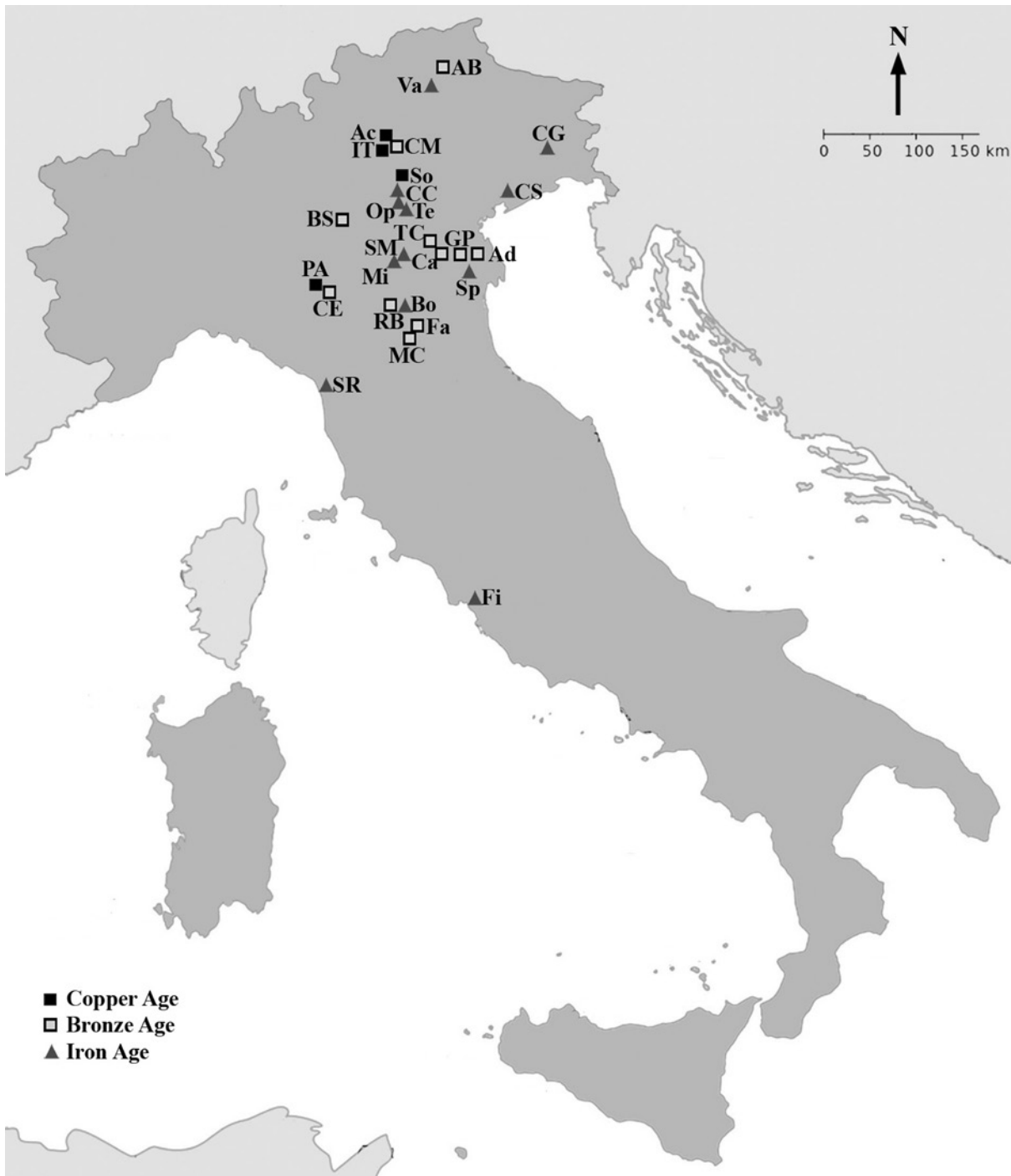
Figure 3: Geographical distribution of Italian sites with Eurasian beaver remains referred to the Metal Ages (alphabetical order). Copper Age: Ac, Acquaviva; IT, Isera Torretta; PA, Parma Aeroporto; So, Riparo Soman. Bronze Age: AB, Albanbuhel – Bressanone; Ad, Adria; BS, Barche di Solferino; Ca, Canàr di S. Pietro Polesine; CE, Celerno presso l’Enza; CM, Colombo di Mori; Fa, Grotta del Farneto; GP, Campestrin di Grignano Polesine; MC, Monte Castellaccio; RB, Rocca di Bazzano; TC, Tombola di Cerea. Iron Age: Bo, Bologna; CC, Colognola ai Colli; CG, Centes di Gradiscutta; CS, Concordia Sagittaria; Fi, Ficana; Mi, Mirandola; Op, Oppeano; SM, San Martino di Spino; Sp, Spina; SR, San Rocchino; Te, Terranegra di Legnago; Va, Vadena.

due to its mentioning in the Dittamondo , a didactic poem by Fazio degli Uberti, who died in Verona in 1368. Speaking of the town of Ferrara and its surroundings, the latter scholar describes a curious aquatic animal, “beast and