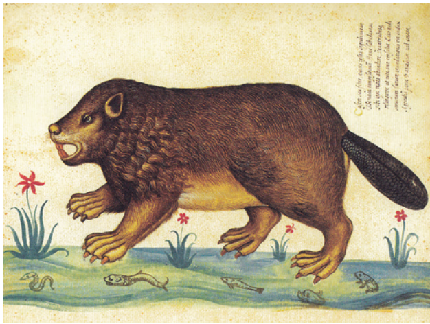
Figure 6: Representation of a Eurasian beaver, Castor fiber , from the Plates of animals (Quadrupedia vivipara, plate I, a, c.97) of Ulisse Aldrovandi (Bologna, 1522–1605).

describes the dissection of a beaver specimen made in Ferrara in 1541: “[...], id anno 1541, nos quoque experti sumus, quum Ferrariæ in officina Nicolai Nicolutri pharmacopolaæ Pineæ, integrum castorem habuimus, et eum circa testes dissecuimus [...] ”.