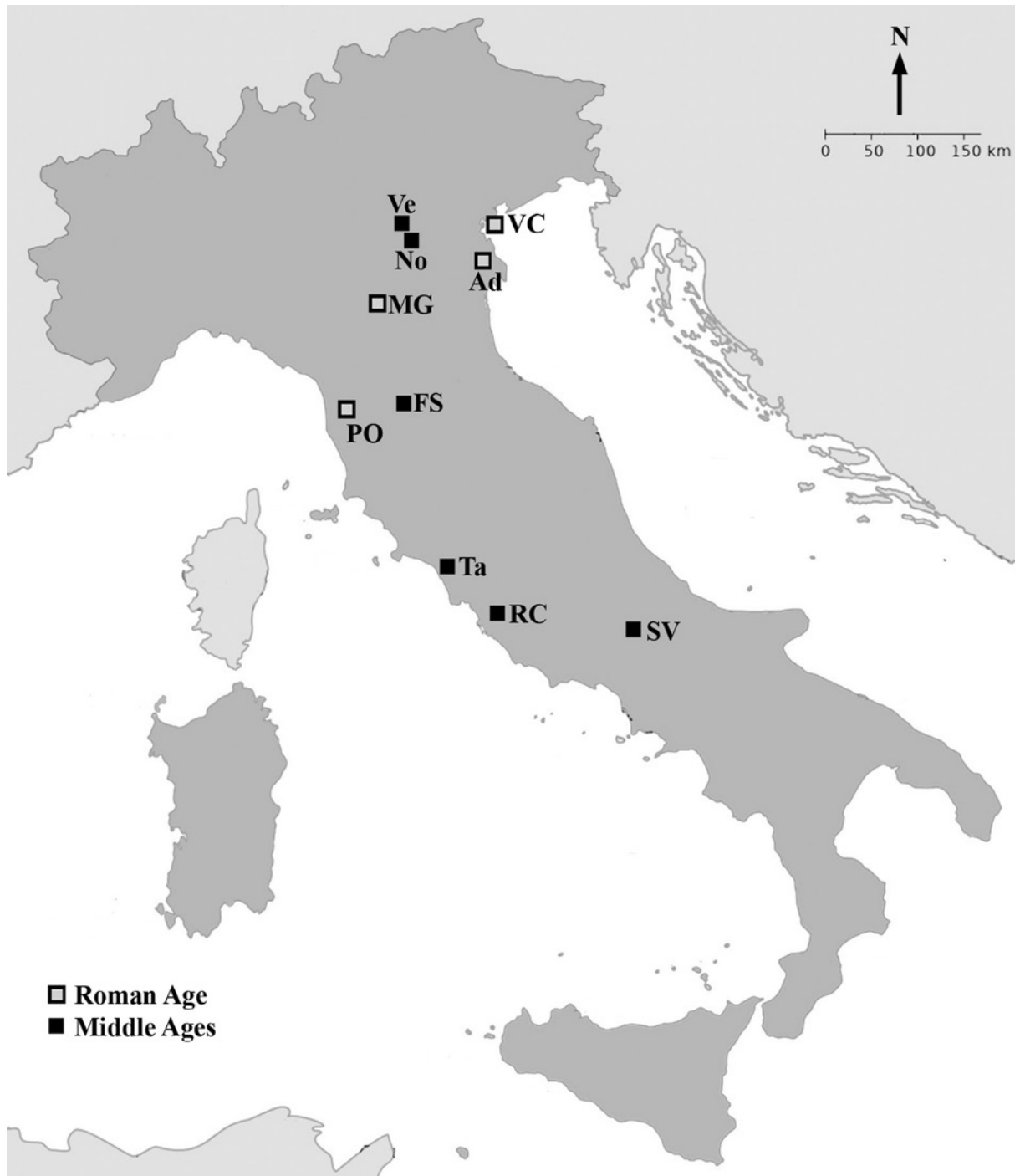
Figure 4: Geographical distribution of Italian sites with Eurasian beaver remains referred to the historical times (alphabetical order). Roman Age: Ad, Adria; MG, Modena – Ghirlandina; PO, Podere Ortaglia; VC, Venice – Canale del Cornio. Middle Ages: FS, Florence – Piazza della Signoria; No, Nogara Veronese; RC, Rome – Crypta Balbi; Ta, Tarquinia; SV, San Vincenzo al Volturno; Ve, Verona.

bièvre , with which the beaver is referred to in the respective languages. In the 16th century, Gesner (1558, p. 337) also reported the presence of beavers near the mouth of the River Po: “[...] ut inquit Strabo. Item in Italia, ubi Padus in mare se exonerat ”. In the following century, Aldrovandi (1637, p. 282, and Figure 6), referring to this last quotation, affirms that he is not able to confirm or deny it: “[...] quod