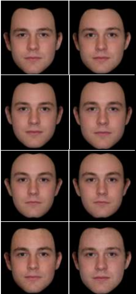
Figure 1. Samples of Study 1 stimulus pairs. From top to bottom: Masculinity (sexual dimorphism); Averageness; Symmetry; Apparent health. Positive transforms on the left, negative on the right.