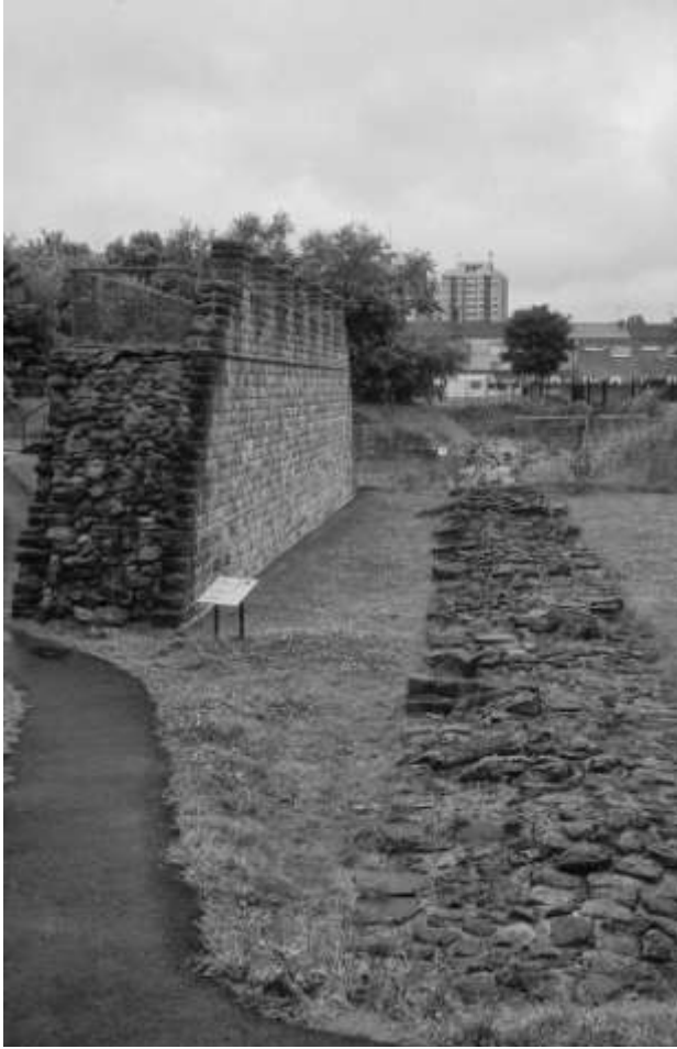
Figure 3. Hadrian's Wall at Wallsend, North Tyneside. A reconstructed section of Hadrian's Wall (left) is located directly next to the exposed foundations of the Roman Wall (right)

In comparison with many of the Greek and Roman monuments of the Mediterranean, such as the Colosseum, Hadrian's Wall is notoriously insignificant in terms of the canon of classical literature – it is mentioned only once or twice in the surviving sources. Nonetheless, the material recovered by excavation has been repeatedly located and interpreted in terms of text-based histories, in particular, it is used to 'materialize' specific historical events (generally, Porter 2003). This is well-illustrated by nineteenth and early twentieth century attempts to relate phases of burning and destruction at many of the forts to hostile incursions from north of the Wall, thus demonstrating the historical veracity of, for example, the 'Barbarian Conspiracy of 367' (Amm. Marc. 27.8.1-28.3.9). As Breeze (2005: 40) emphasizes, such readings of textual and archaeological evidence are intimately connected with (often implicit) assumptions about the function of the Wall informed by contemporary values. Within the context of broader societal attitudes towards frontiers as defensive and exclusive, scholars have prioritized scarce and unrepresentative historical sources and used the very materiality of the Wall to make them tangible. Even the scholarly language used to describe the Wall is culturally-loaded and informs