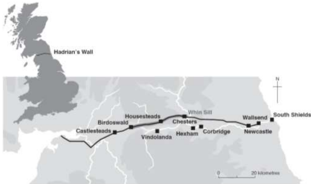
Figure 2. Hadrian's Wall. Location and places mentioned in the text (Map: C. Unwin)

of an archaeological monument which has physically endured whilst perceptions, values, texts and images have evolved around it. Rather, we sketch the ways in which the monument and its setting have materially changed alongside socio-cultural valuations in a transformative and affective relationship.