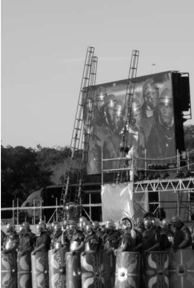
Figure 1. 'Living Frontier' re-enactment event at Corbridge, Northumberland, June 2009

In this paper we aim to draw out the political uses of the Wall through an analysis of its materiality. We consider how processes such as survey, excavation, illustration, conservation and World Heritage Site status have functioned, sub-consciously or otherwise, to define hegemonic interpretations. For example, the boundary of the national spaces of England and Scotland has, since the sixteenth century, been sanctioned in a variety of texts and representations through promotion of the Wall's monumentality and its genealogical associations (Griffiths 2003; Hingley 2008: 86-7).