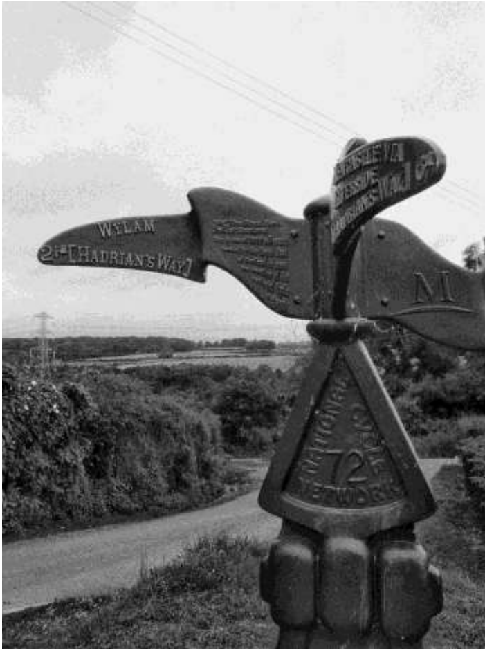
Figure 4. Hadrian's Wall street furniture. Sign post on the Hadrian's Wall National Trail at Newburn, Newcastle upon Tyne

collection of inscribed stones, the Roman past was rematerialized through commemoration, for example, a plaque on Neville Hall draws attention to paving which marks the line of the Wall. [FIGURE 5] The Neoclassical redevelopment of Newcastle by Dobson and Grainger can be located within a wider mid-nineteenth century trend which found inspiration in the Greek and Roman world generally, but it may also have drawn on the emerging traces of the city's own Classical past (Wilkes & Dobbs 1964).