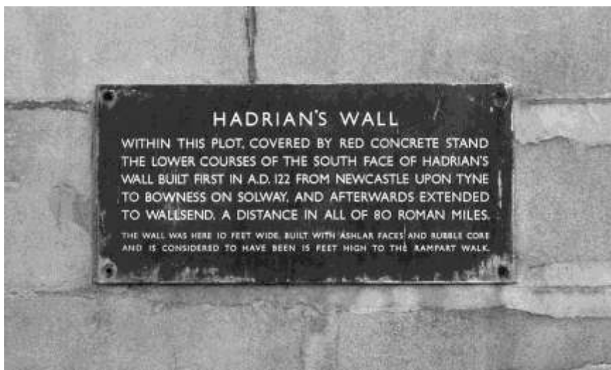
Figure 5. Commemorative plaque on Neville Hall, Westgate Road, Newcastle upon Tyne.

Such rematerialization continues today. Public art such as the Newcastle through the Ages (by Henry and Joyce Collins, 1974) draws on the city's Roman past to create a narrative of famous men, commerce and, particularly, engineering (Usherwood et al. 2000: 125-6) and signs at Wallsend Metro station inform and advise commuters in Latin as well as English. These materialities presence the Roman past in a landscape devoid of extant monumental traces and assert connections between local and Roman achievement and shared moral aspirations.